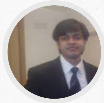
New York, NY IT Management