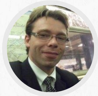
CEO, NY Strategy