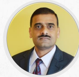
New York, NY IT Solutions